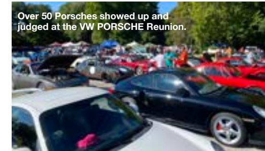
Over 50 Porsches showed up and judged at the VW PORSCHE Reunion.