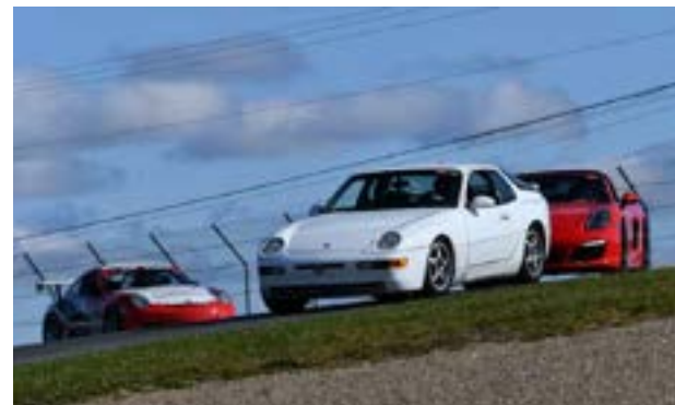
There's always plenty of action in the Keyhole.