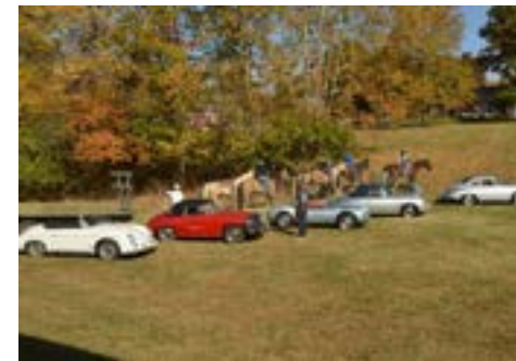
What's better than Porsches, horses and of course chilli on a nice fall day.

There was an amazing array of ten crock pots full of chili, and the dessert table was overflowing with delectable items. The pumpkin flavored Whoopie Pies were wonderful!