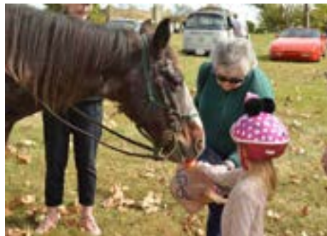
The horses were a big hit with the kids.