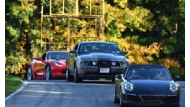
Autumn at Mid-Ohio.

Throughout the day we had a group of crusty old guys rotating through pit