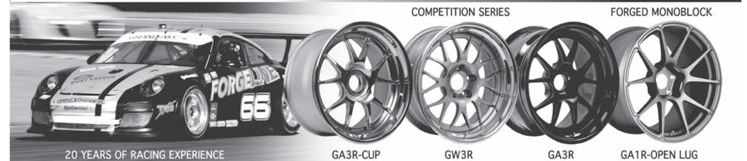
20 YEARS OF RACING EXPERIENCE