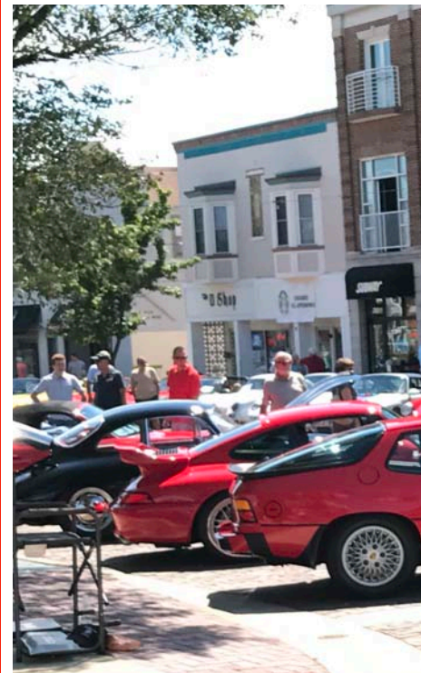
It won't be long before it's showtime.