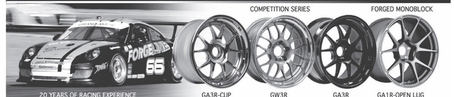
20 YEARS OF RACING EXPERIENCE