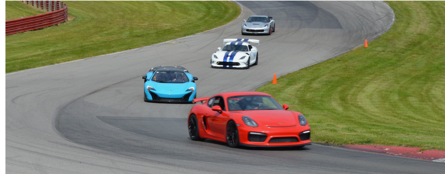
At the track, a dry track is just as important as a cool running car...

To this point all the preceding information is coming from a summary