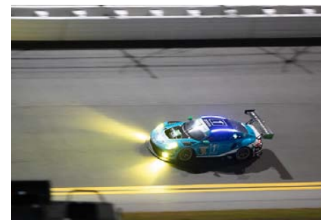
Nighttime on the banking...

Those of us who appreciate motorsport racing, whether it be a participant in Driver Education track events, Club Racing, auto-crossing, watching or photographing, volunteer working at events can appreciate all the work and skills at which drivers and their support teams excel.