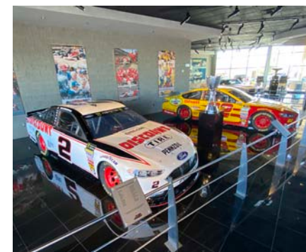
2018 Brickyard and 2015 Daytona 500 winning Penske cars.