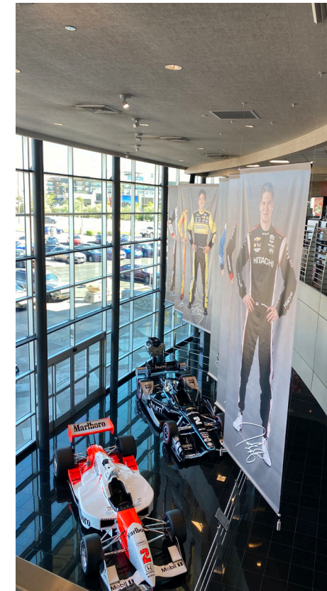
Banners of current Penske drivers dominate the entrance.

The building itself is a 2-story modern beauty of glass and steel overlooking the test track and Land Rover off-road course. It is just what you would expect from "The Captain". Huge banners featuring current Penske drivers dominate the entry. Victory Lane photographs of drivers like Donohue, Mears, Unser, DeFerran, Sneva, Sullivan, Pagenaut and Castroneves accompany the winning cars on display. The mezzanine showcases are filled with trophies and memorabilia from Penskes' more than 500 major race wins, 34 championships and 17 Indy 500 victories.