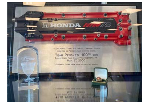
2000 Honda Turbo V8 "HR-0" Camshaft Cover from Team Penske's 100th Win, presented by Honda.

Last, but not least, the friendly staff is ready to answer any questions or suggest other attractions in the area.