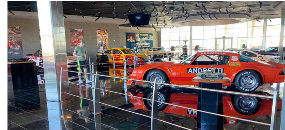
Clean design layout of an amazing collection of winning Penske cars.