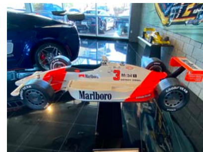
One of several wind tunnel models on display.