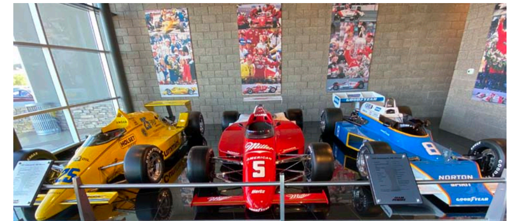
Winning cars driven by Rick Mears, Danny Sullivan and Tom Sneva.

Also on the mezzanine, Turn 4 Cafe offers great food options Monday through Friday from 8:00am to 3:00pm. Enjoy a leisurely breakfast or lunch with a view of the cars below. The Boutique has a variety of Penske merchandise.