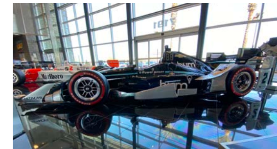
Josef Neugarden's 2017 Verizon IndyCar Championship car.