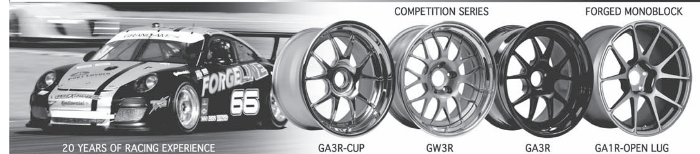
20 YEARS OF RACING EXPERIENCE